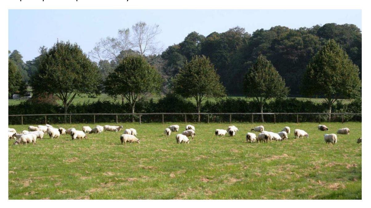
At peace ...

Let us to consider God's peace that can operate in our own hearts through our Lord Jesus Christ, and that this comes about through the principle of connection . This principle is implied in many verses.