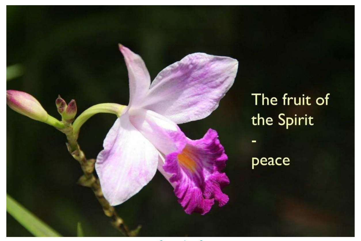
Peace of God – for us

"And the peace of God, which transcends all understanding, will guard your hearts and your minds in Christ Jesus." Philippians 4:7