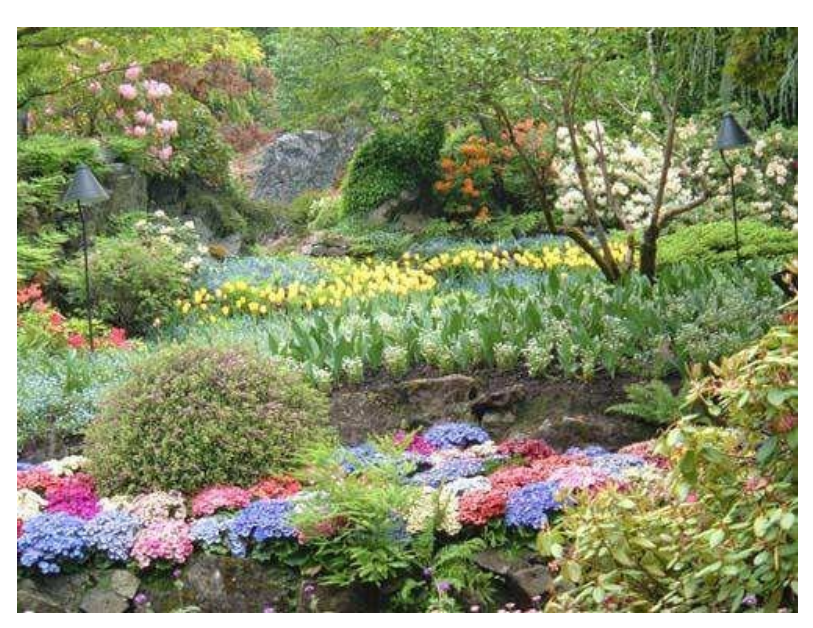
The peace and beauty of nature

"Come to me, all you who are weary and burdened, and I will give you rest. Take my yoke upon you and learn from me, for I am gentle and humble in heart, and you will find rest for your souls. For my yoke is easy and my burden is light."